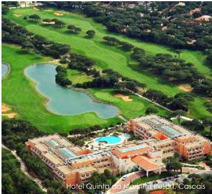
Hotel Quinta da Marinha Resort, Cascais