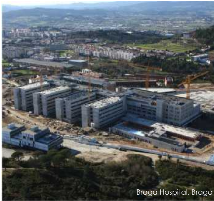
Braga Hospital, Braga