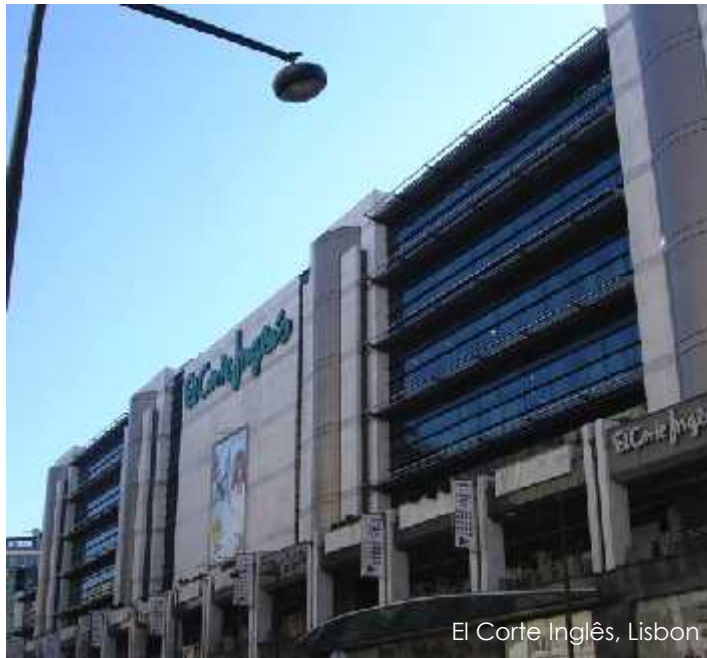
El Corte Inglés, Lisbon