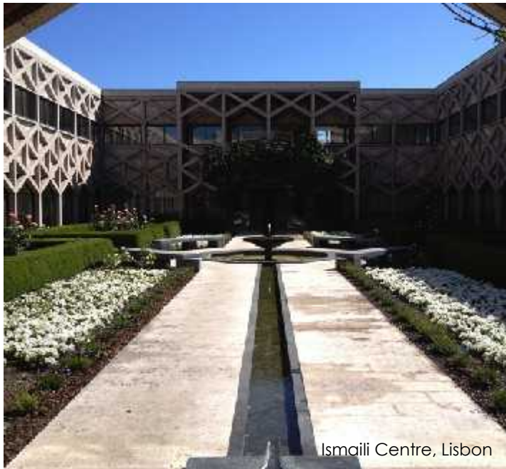
Ismaili Centre, Lisbon