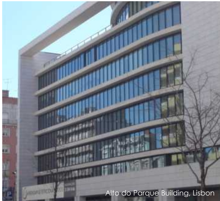
Alto do Parque Building, Lisbon