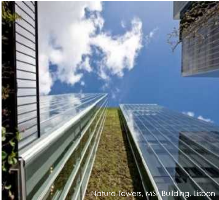
Natura Towers, MSF Building, Lisbon