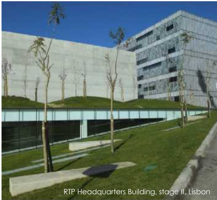
RTP Headquarters Building, stage II, Lisbon