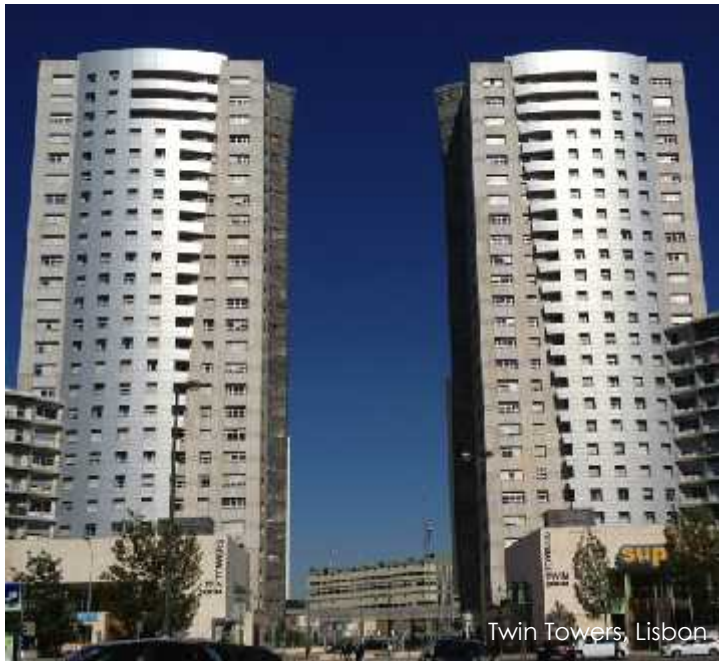
Twin Towers, Lisbon