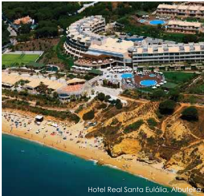
Hotel Real Santa Eulália, Albufeira