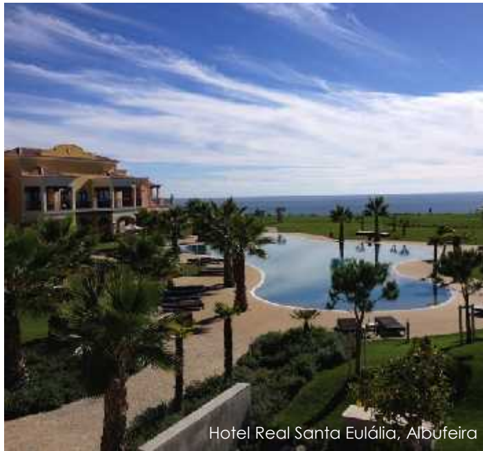
Hotel Real Santa Eulália, Albufeira