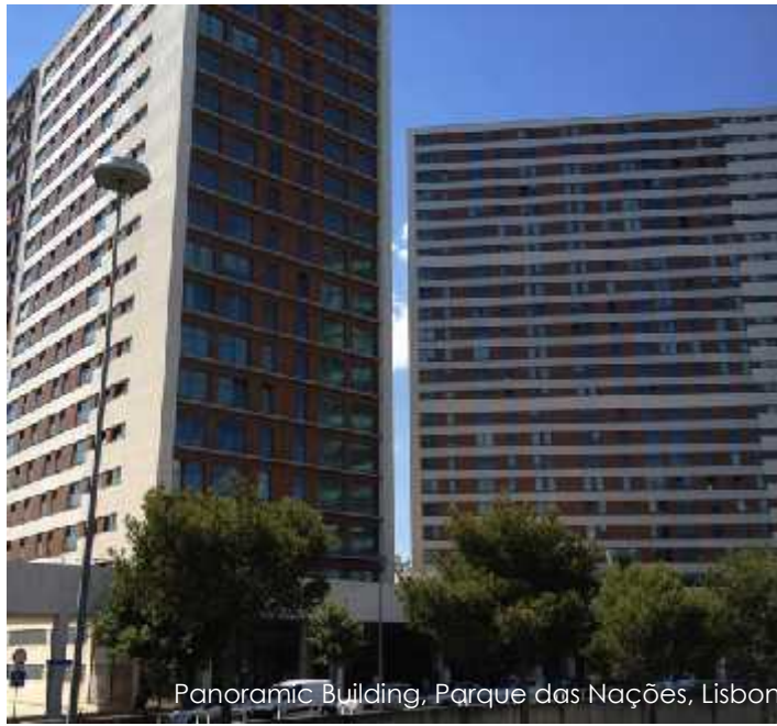
Panoramic Building, Parque das Nações, Lisbon