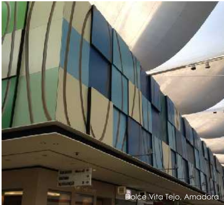
Dolce Vita Tejo, Amadora