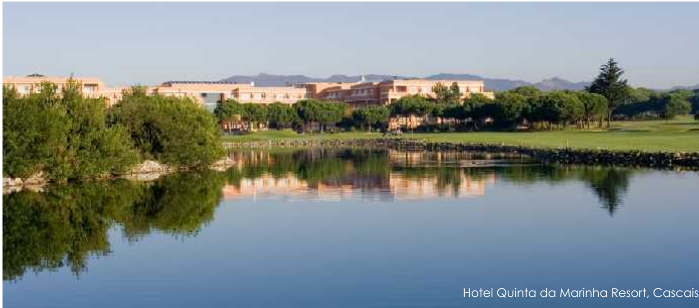
Hotel Quinta da Marinha Resort, Cascais

DUCTOS, SOCIEDADE DE PROJECTOS, LDA. , started off as a private limited corporation in July 1992, as a result of an already long collaboration between its partners, collaborators and consultants, working together in the preparation and implementation of studies and projects for public and private entities.