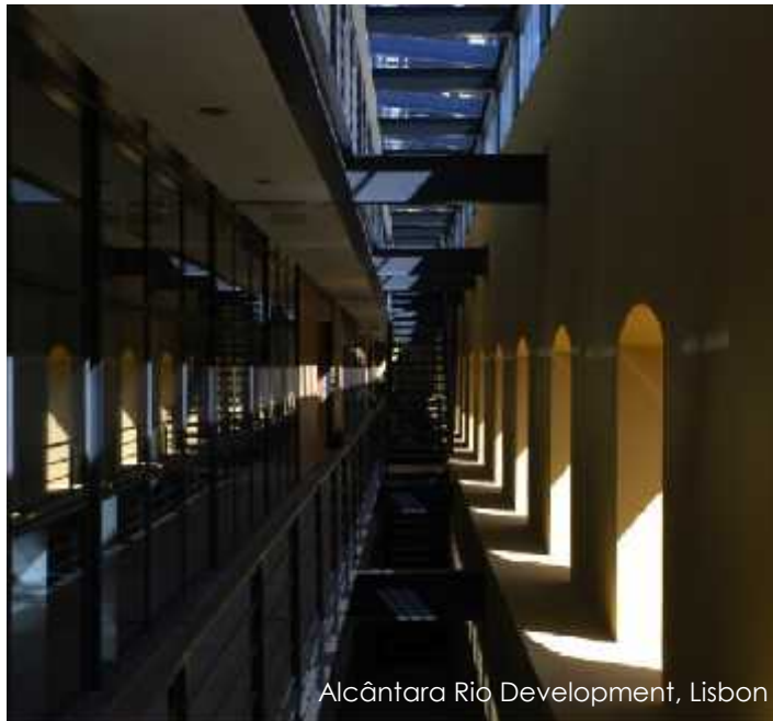
Alcântara Rio Development, Lisbon

Resorts / Allotments; Marinas / Harbors; Sports Facilities; Offices; Housing / Residential; Hotels; Shopping Centres; Schools / Public Buildings; Hospitals; Banks / Bank Offices; Other Projects; Sustainability.