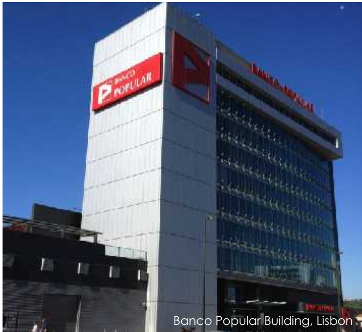
Banco Popular Building, Lisbon