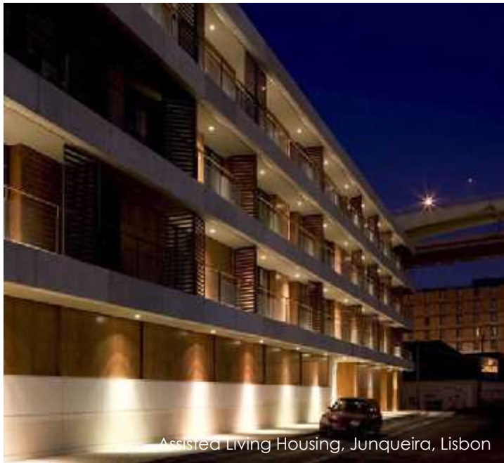
Assisted Living Housing, Junqueira, Lisbon