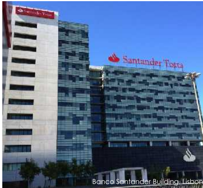
Banco Santander Building, Lisbon