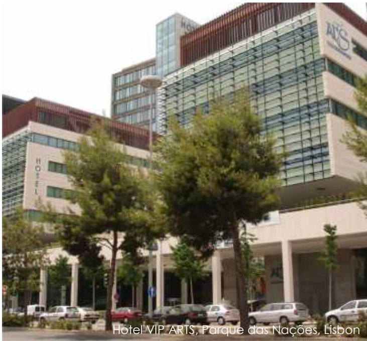
Hotel VIP ARTS, Parque das Nações, Lisbon