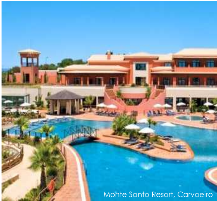
Monte Santo Resort, Carvoeiro