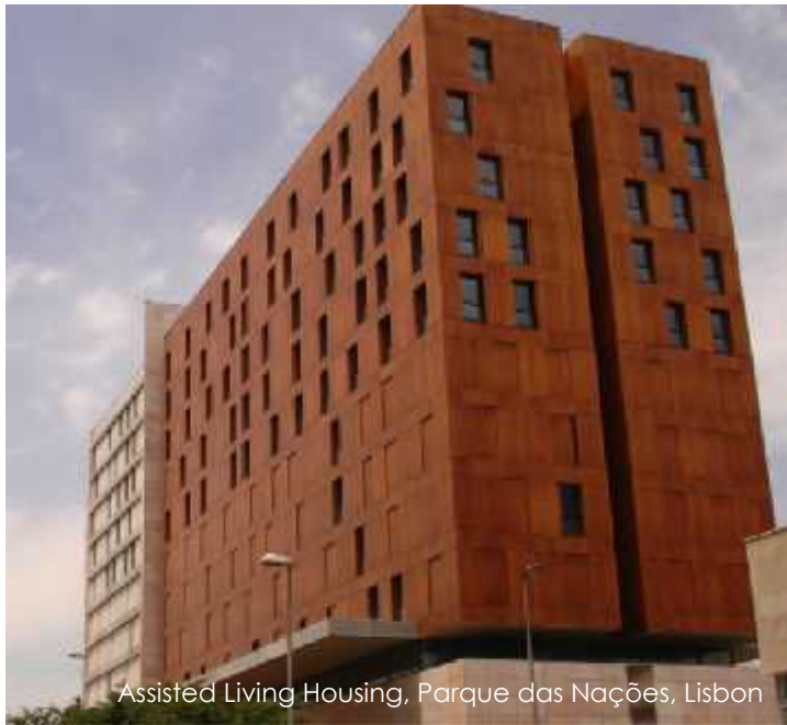
Assisted Living Housing, Parque das Nações, Lisbon